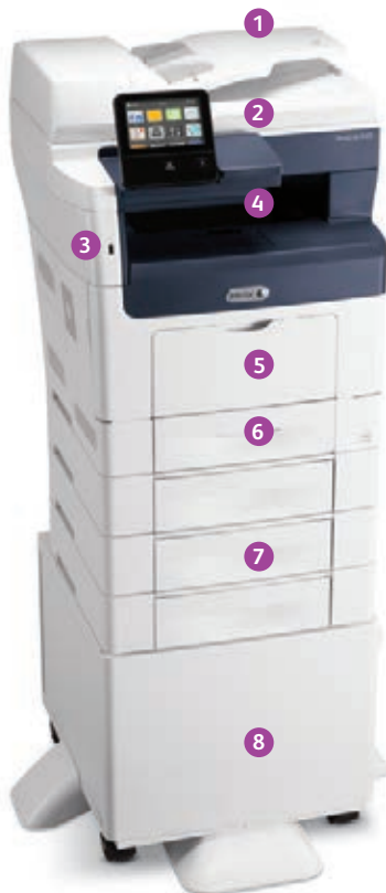
Xerox® VersaLink® B405 Multifunction Printer Print. Copy. Scan. Fax. Email.