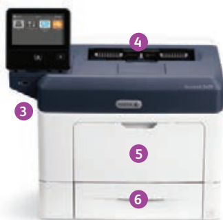
Xerox® VersaLink® B400 Printer Print.