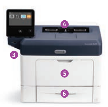
Xerox® VersaLink® B400 Printer Print.