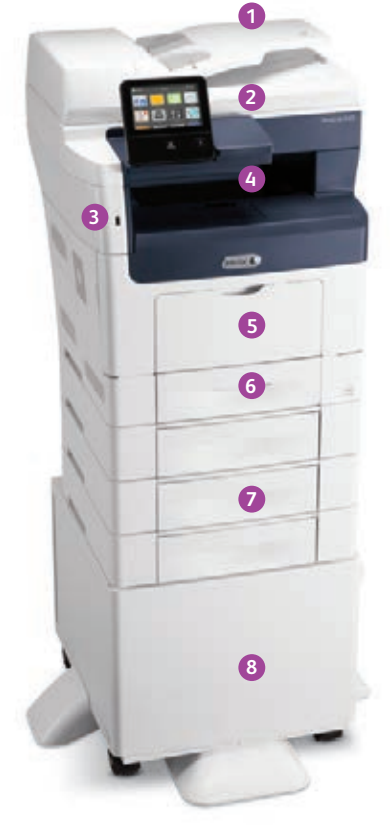
Xerox<sup>®</sup> VersaLink<sup>®</sup> B405 Multifunction Printer Print. Copy. Scan. Fax. Email.